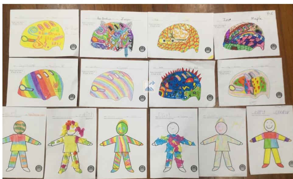
Our Winning Entries